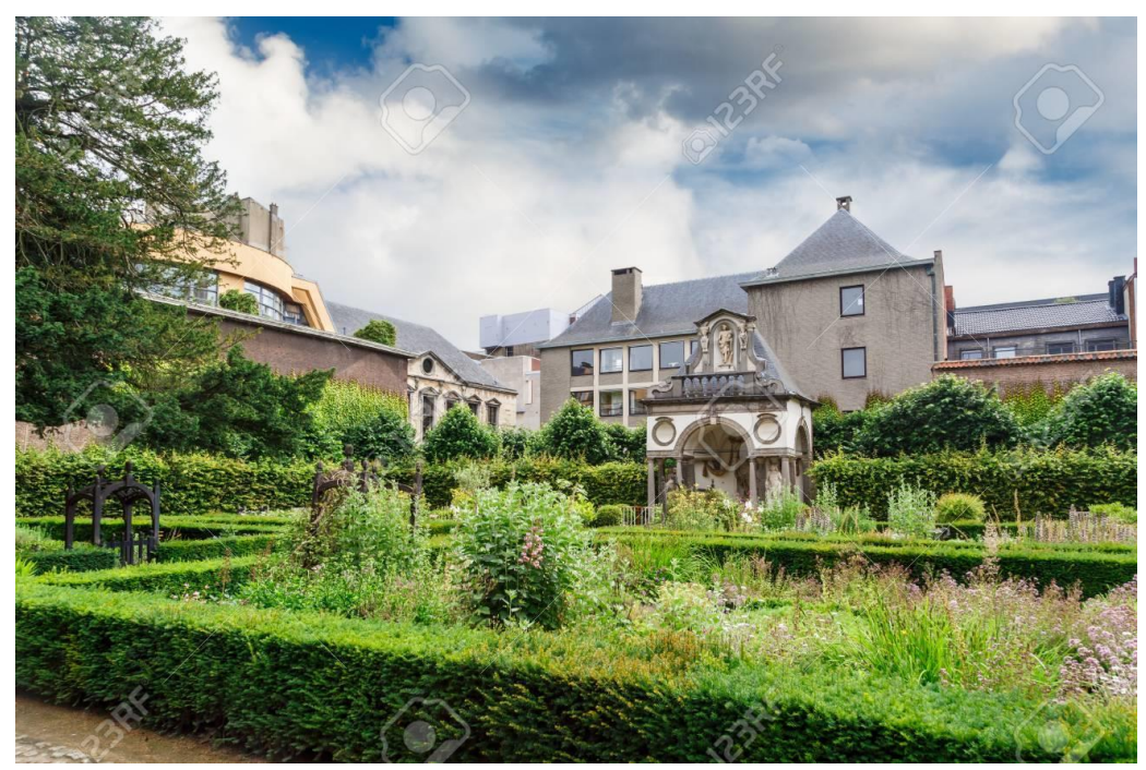
Stop to visit the atelier/house of the Baroque painter Pieter Paul Rubens, now a museum.

Visit of Kazerne Dossin museum, a special place of remembrance for the Jews of WWII.