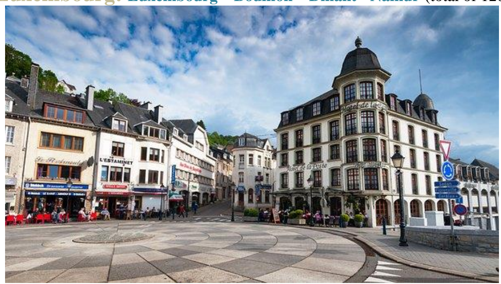
Day 7 Luxembourg: Luxembourg – Bouillon – Dinant - Namur (total of 126 Miles)

Breakfast in your hotel (Included in package).