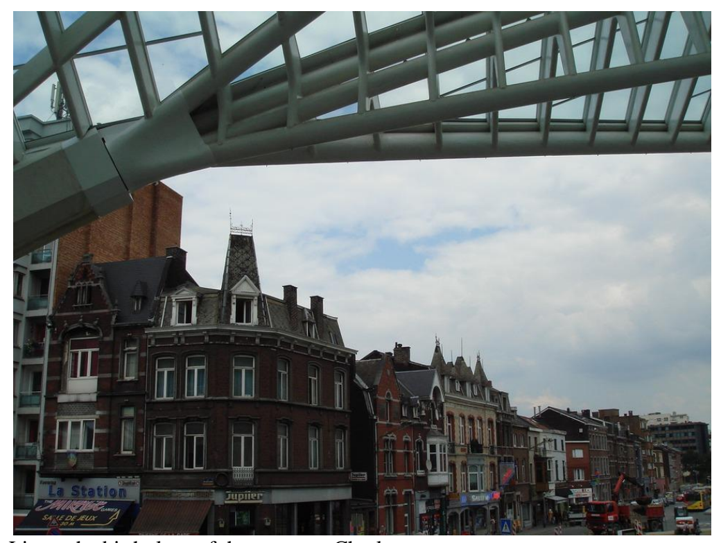
Drive to Liege, the birthplace of the emperor Charlemagne.