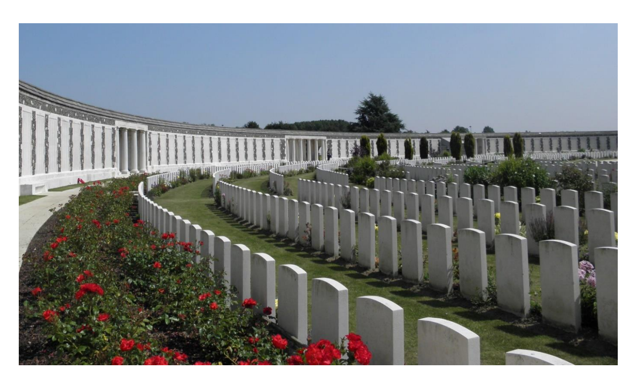
Continue to Ypres and Ypres Salient to see the historic sites of the WW1 - Essex Farm and the station where "In Flanders Fields" was written.