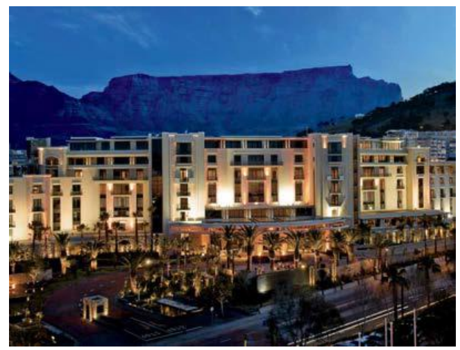
One&Only Cape Town

And we'll take a full-day tour of the Cape Peninsula, including a trip on the Flying Dutchman Funicular to the tip of dramatic Cape Point, where we'll look out at the great waters of the Atlantic tussling with the equally insistent waters of the Indian Ocean. We'll visit Cape penguins in their daily rounds, ramble in Victorian-flavoured Simon's Town, and at dinner tonight we'll be treated to thrilling South African interactive drumming, which must be seen and heard to be believed, and which will make true, bedazzled believers of us.