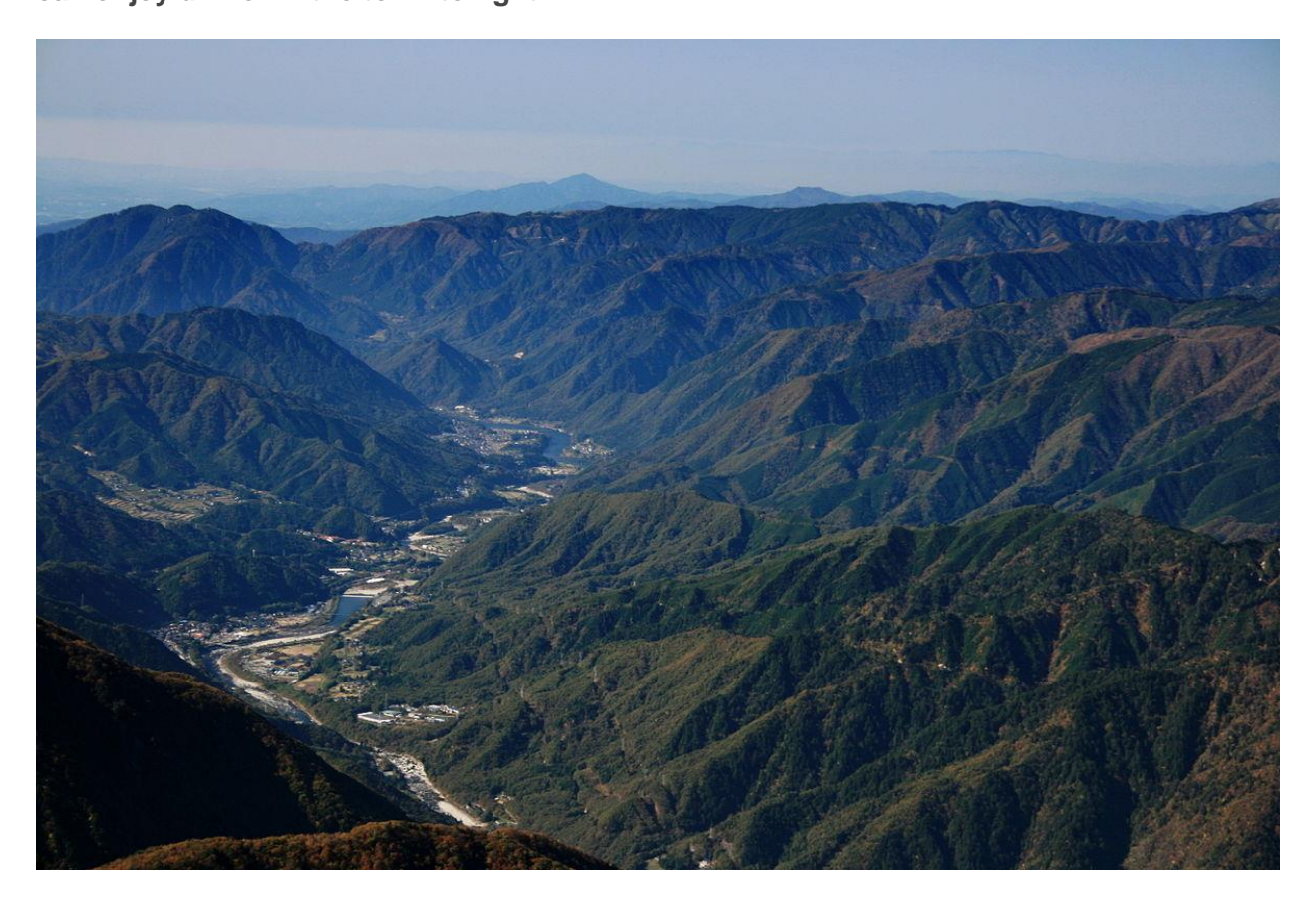
Day 14 Japan: Kiso Valley - Tokyo

Lunch & Dinner is on your own. Your guide will make arrangements for lunch and you can enjoy dinner in the town tonight.