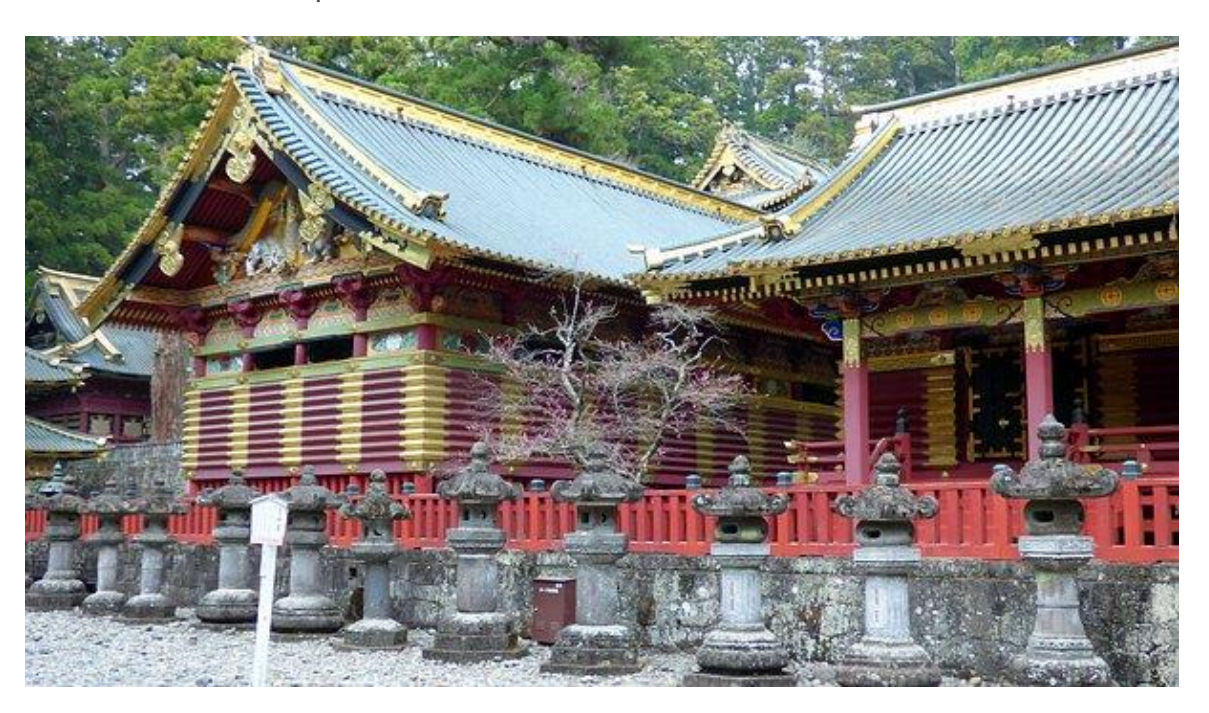
Other Options for this last day in Tokyo:

Nikko lies in a northern mountainous region , and you can visit the Toshogu Shrine complex and the Tamozawa Imperial Villa.