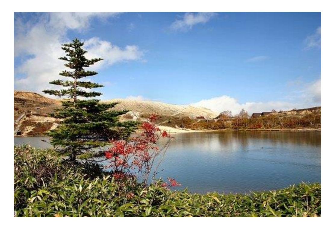
Day 8 Japan: Takayama

Dinner is on your own today. See Celebration Escapes' Restaurant Collection for recommendations for dinning in Takayama.