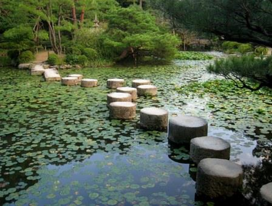
After the tour, you will be returned to your hotel, where you are at leisure for the remainder of the day

Dinner are on your own today. See Celebration Escapes' Restaurant Collection for recommendations for dinning in Kyoto.