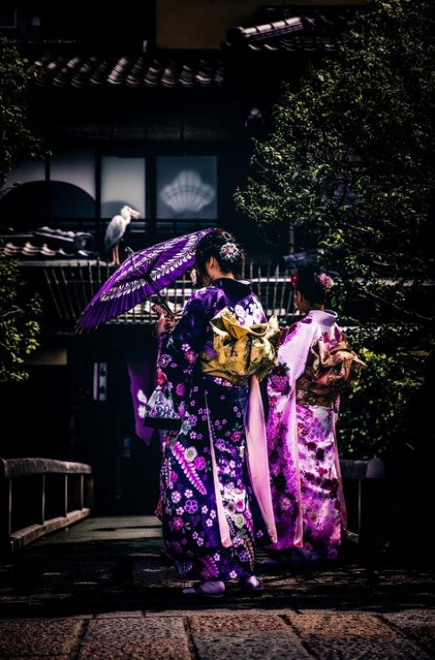
Dinner is on your own today. See Celebration Escapes' Restaurant Collection for recommendations for dinning in Kyoto.