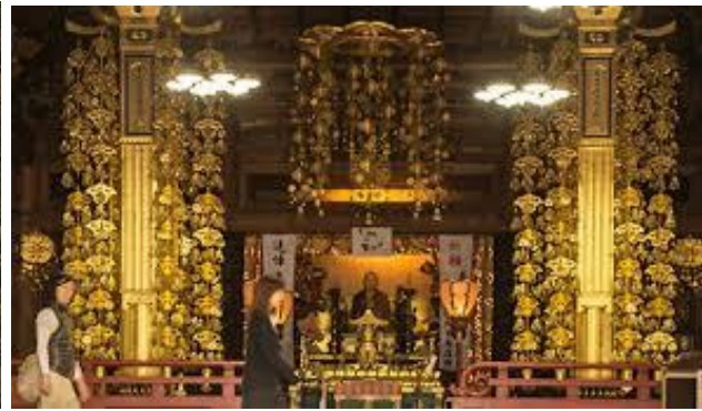
The guide will then escort you to the shukubo 'temple lodge' where Buddhist cuisine is served.