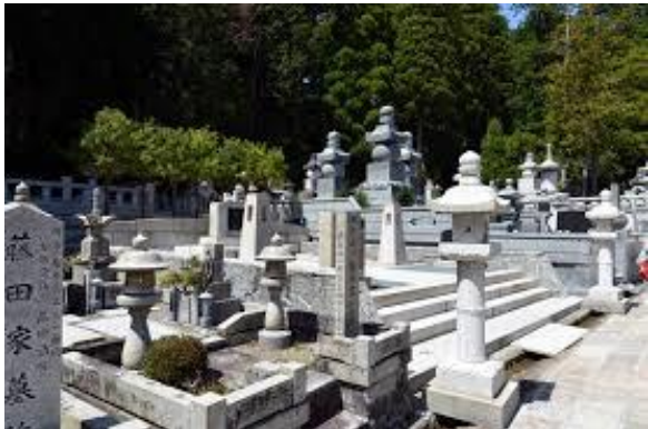
The Mausoleum of Kobo Daishi