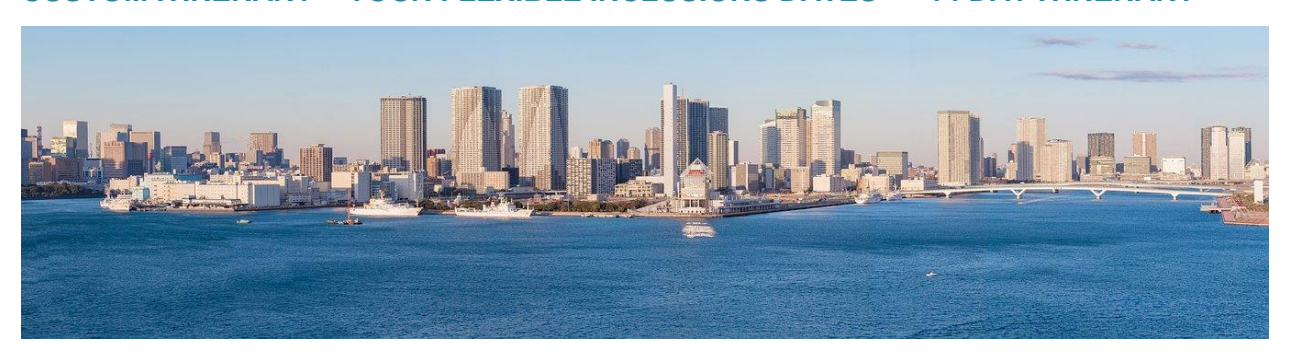
14 Day Japan Itinerary: Discover The Wonders Of Japan Off The Beaten Path