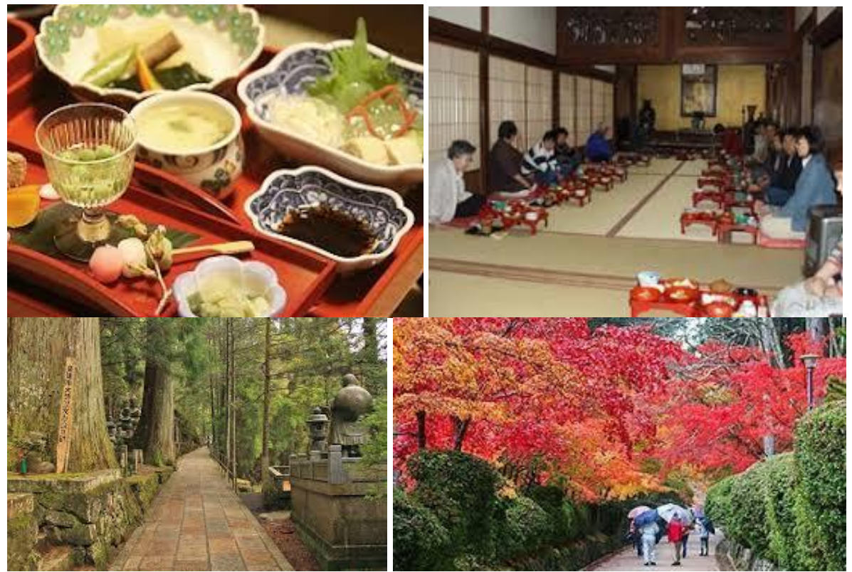
After the tour, you will be returned to your hotel, where you are at leisure for the remainder of the day.

Dinner are on your own today. See Celebration Escapes' Restaurant Collection for recommendations for dinning in Kyoto.