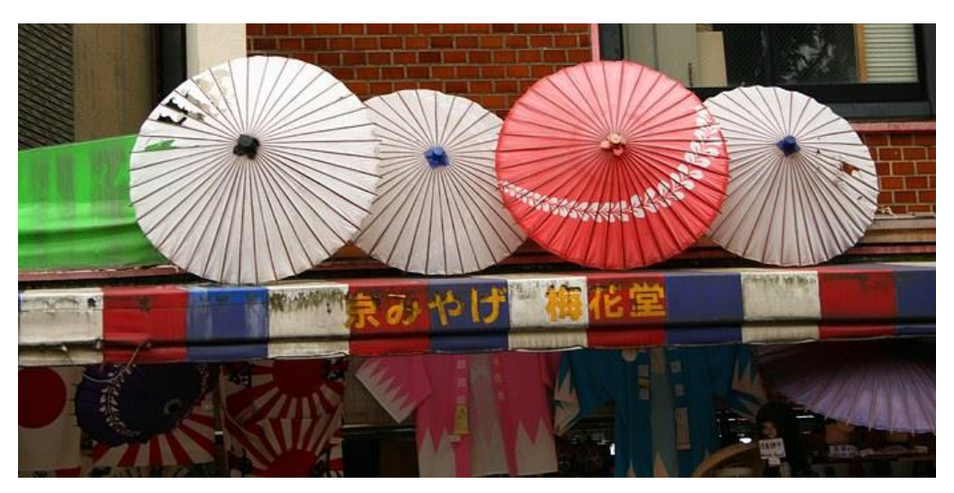
Day 3 Japan: Tokyo

Breakfast in the hotel (Included in your package).