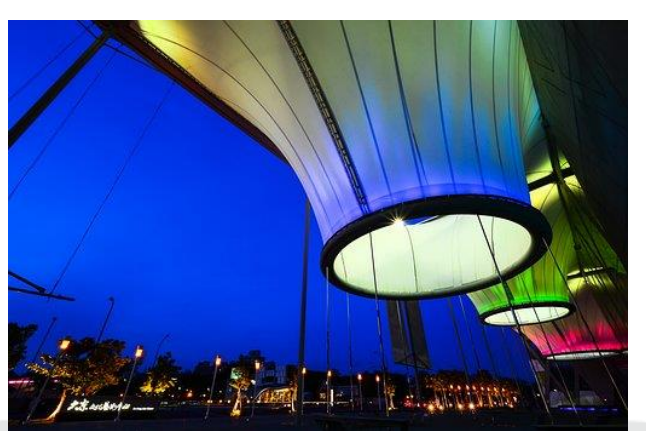
Tokyo Culture Center

After breakfast, you are at leisure, free to relax in the hotel, enjoy the spa, or explore Tokyo at your leisure.