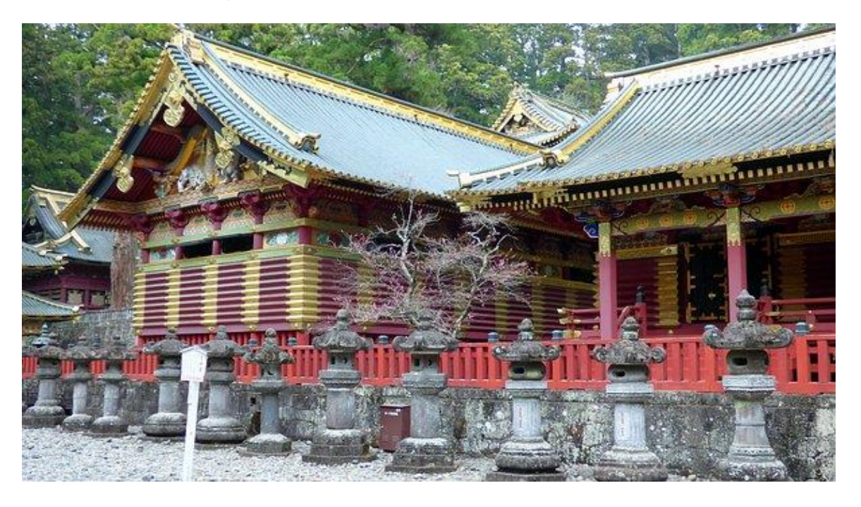
Day 5 Japan: Tokyo - Kanazawa

Nikko lies in a northern mountainous region , and you can visit the Toshogu Shrine complex and the Tamozawa Imperial Villa.