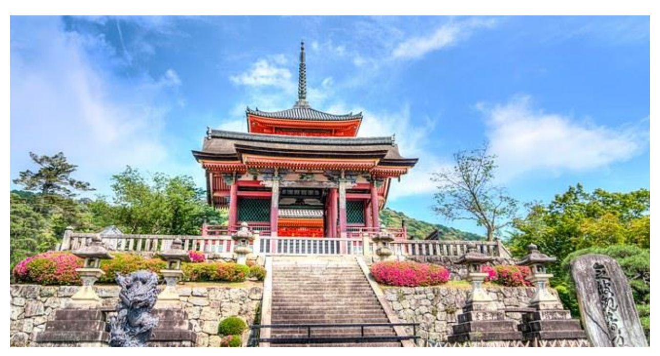
Day 9 Japan: Takayama – Kyoto

Breakfast in the hotel (Included in your package).