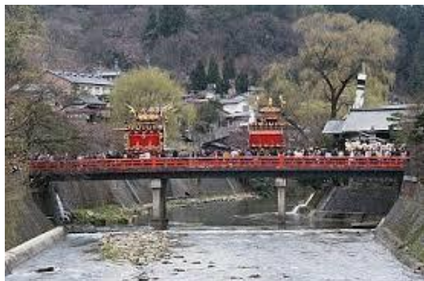
Explore Takayama with your guide, learning about the town's history and familiarizing your taste buds with local delicacies.

The walking tour includes visits to a tofu seller and a rakugan (traditional candies) shop.