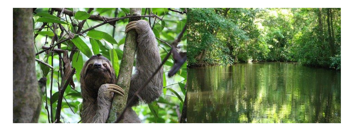
Day 5 Puerto Viejo / Tortuguero

Early morning departure towards the Port of Matina where you board a boat to begin our journey along waterways adorned with the flora and fauna of a tropical rain forest of the Tortuguero Canals. Your tour of the region begins with the transfer offering opportunities to spot many tropical birds and occasionally monkeys and sloth.