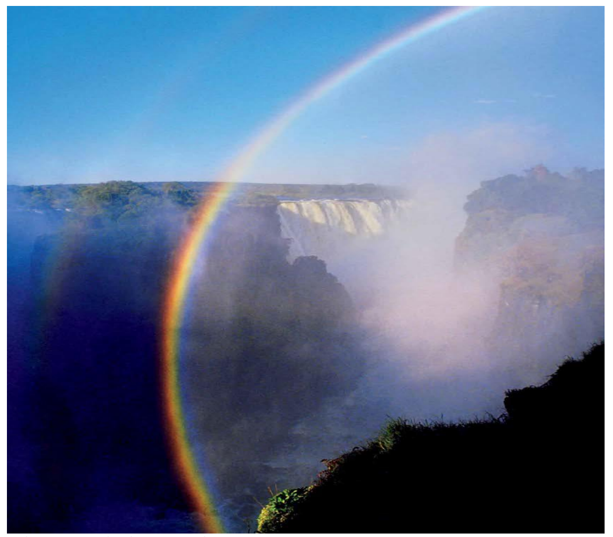
17 days Departs Wednesday, returns Friday