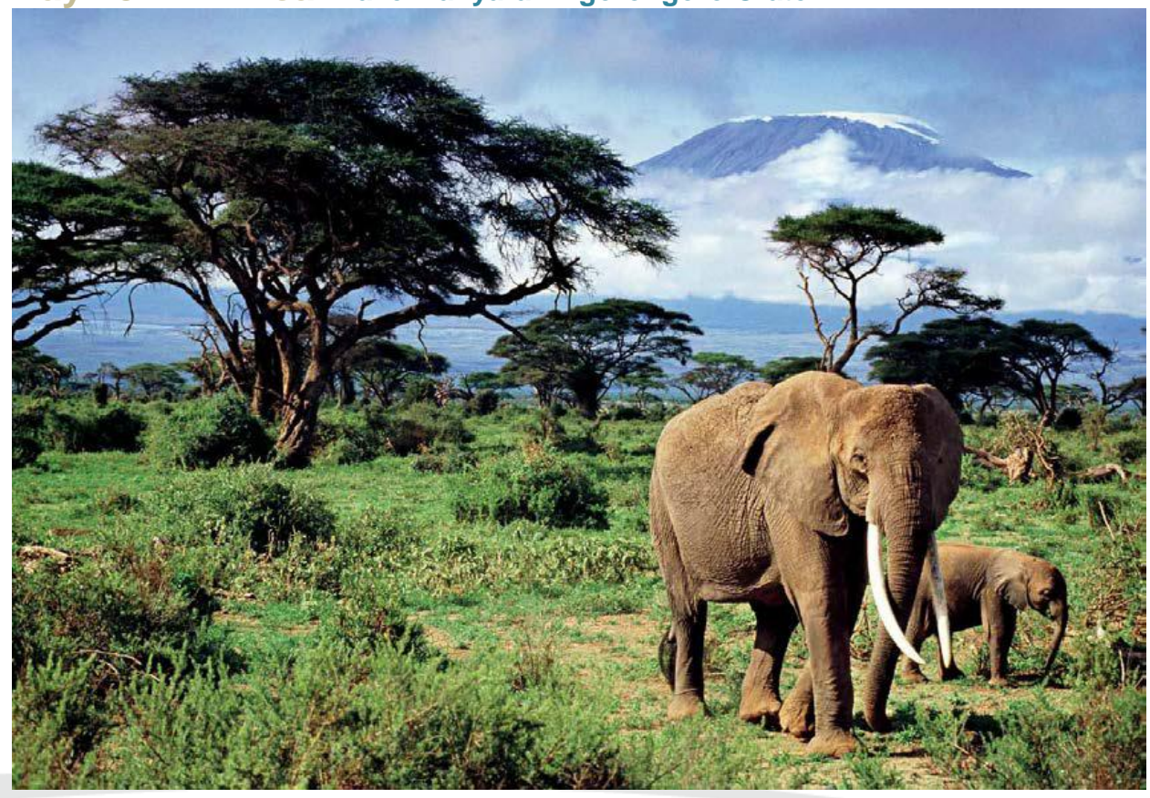
Day 10-11 Africa: Lake Manyara - Ngorongoro Crater

Situated on the edge of the Great Rift's slowly receding wall, overlooking the spectacular lake—which Ernest Hemingway considered the most beautiful in Africa—where masses of pink flamingos flock, the Escarpment Luxury Lodge features spacious chalets spread out over its gardeny grounds. Each chalet has a large bedroom and separate lounge, leather sofas, canopied beds, a deep soaking tub, indoor and outdoor showers, and a vastly viewful private deck.