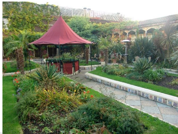
Your first stop is the Kensington Roof Gardens