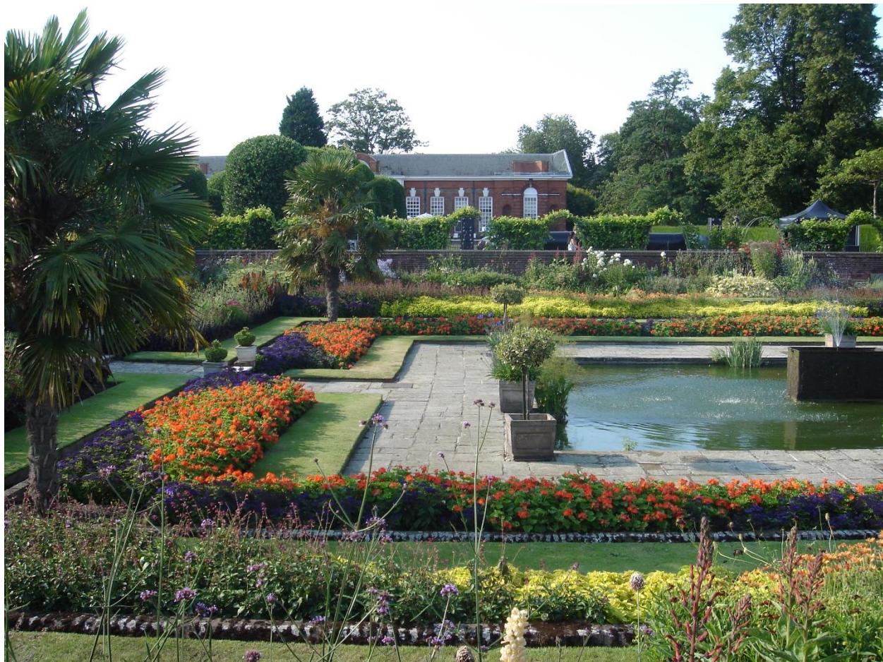
Your next stop is the Kensington Roof Gardens