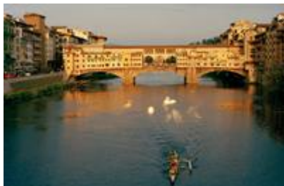
Left Bank of Florence, Palazzo Pitti

After breakfast , meet your English-speaking private driver and Professional local guide in the lobby of your hotel for your Left Bank & Pitti Palace and Boboli Gardens Tour