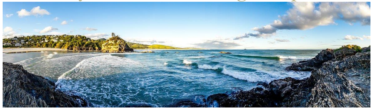
Blanket Bay - Huka Lodge - Kauri Cliff's Lodge