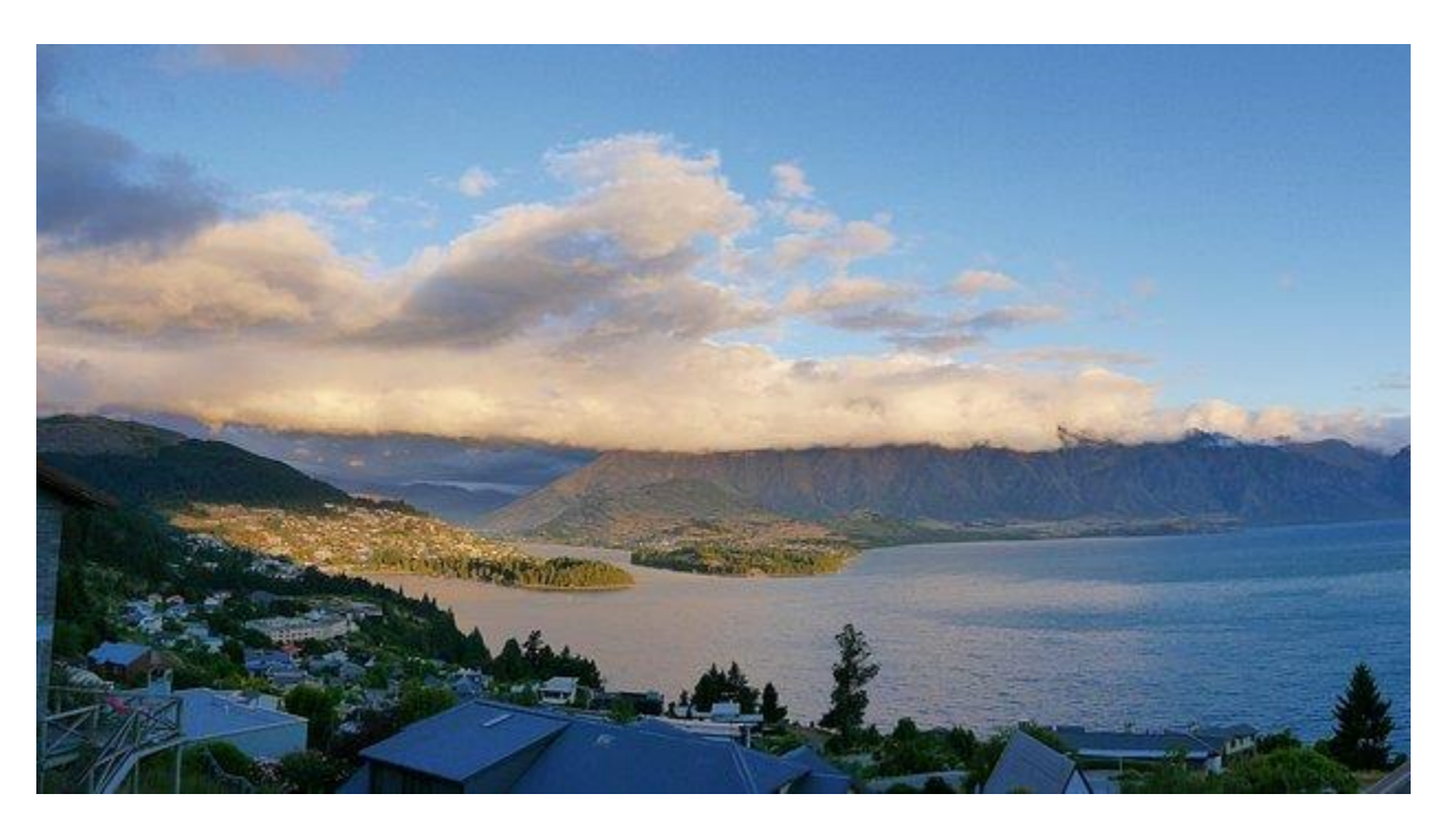
New Zealand's spectacularly beautiful landscape includes vast mountain chains, steaming volcanoes, sweeping coastlines, deeply indented fiords and lush rainforests.