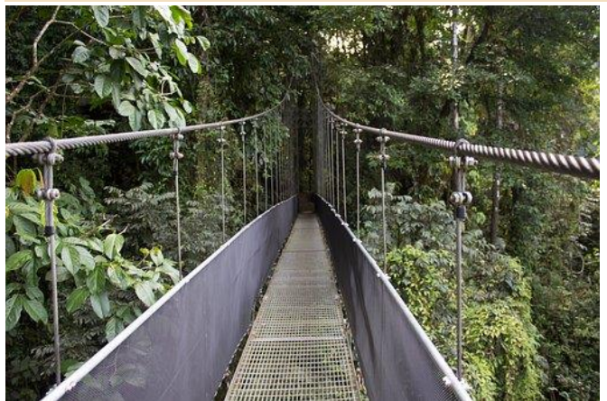
Day 4 La Fortuna / Monteverde

Day 3 La Fortuna (Sky Tram & Sky Trek Tour)