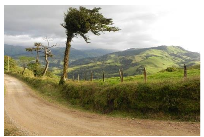
Establo Lodge. (B) Day 5 Monteverde / Manuel Antonio

You will be able to walk right into the forest, thanks to the imposing hanging bridges and the beautiful trails that are safe and easy to walk on. Return to your hotel for overnight. (B)