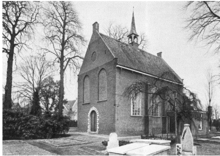
Church Van Gogh's Father Pastored