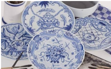
Royal the Hague and Delft