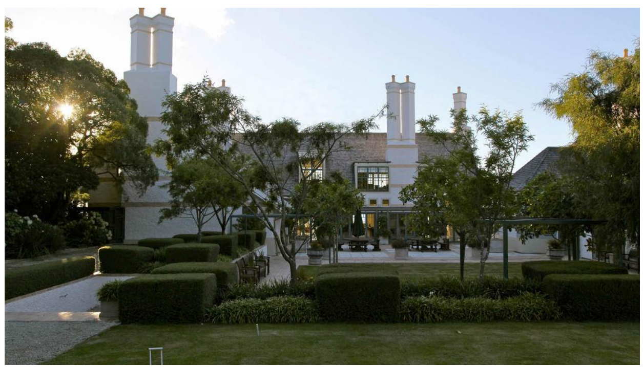
rivate helicopter transfer to Wharekauhau Country Estate and 4 WD farm safari WHAREKAUHAU FARM TOUR

This working sheep station tour - in a comfortable 4-wheel drive vehicle - is an absolute must for all Wharekauhau Visitors. Bordered by the Rimutaka Ranges and Pacific Ocean, this classic Kiwi Romney sheep station features all the activities that have created New Zealand's legendary farming heritage, including sheep shearing demonstrations, sheep dogs in action and daily farm events.