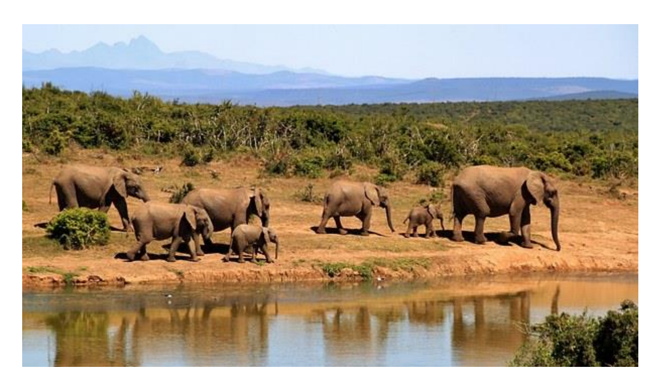
CUSTOM ITINERARY – YOUR DATES – FLEXIBLE INCLUSIONS – 7 Day Itinerary

The Private Game Reserves of and Beyond - - 6 Night South African Safari