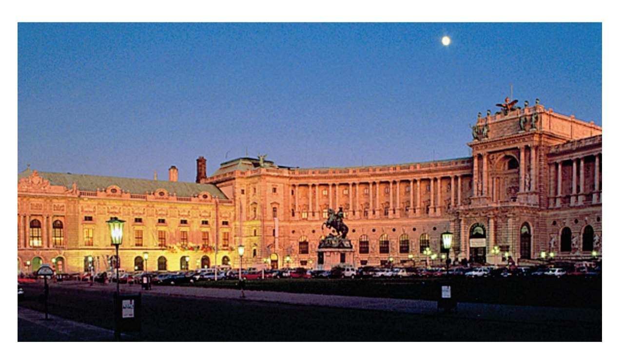
CUSTOM ITINERARY - YOUR DATES - FLEXIBLE INCLUSIONS - 7-10 Day ITINERARY